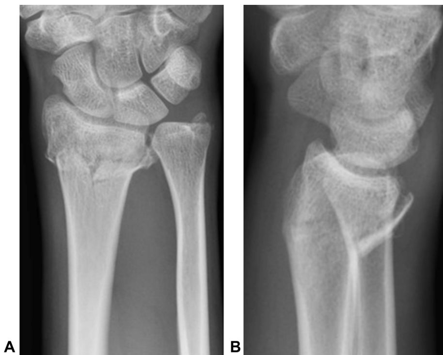
Figure 1. A, B Preoperative radiographs of a distal radius fracture.

procedure include the small incision size, cost reduction, possible implantation using local anesthesia with sedation, utility in medically unstable patients, and the strength to withstand an early wrist active ROM program. The authors hypothesized that threaded pin fixation after DRF restores wrist function earlier than volar plate fixation. The primary outcome of interest in this study was the time from surgery until therapy discharge.